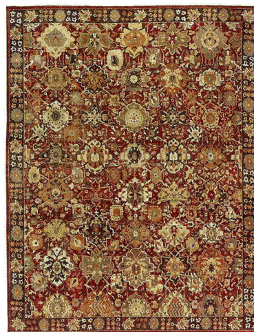
Clockwise from top: French Accents, handmade category ($46.01 to $56 per sq. ft.); Obeettee, handmade category ($65.01+ per sq. ft.); Karastan, power-loomed category ($1,000+ per sq. ft.); and Couristan, Inc., power-loomed category ($400 to $1,000 per sq. ft.)